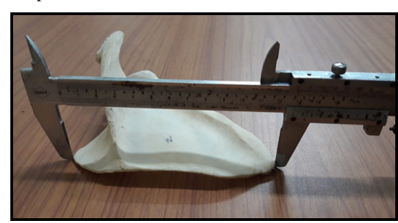
Fig-2: Scapular length measurement by Vernier caliper.

Measurements were taken in millimetre with the help of Vernier calliper (with precision 0.02 mm), osteometric board, white paper, lead pencil. We took measurement of each data three times by two observers and finally took the mean value of each data to avoid observational bias (Fig 2-5).