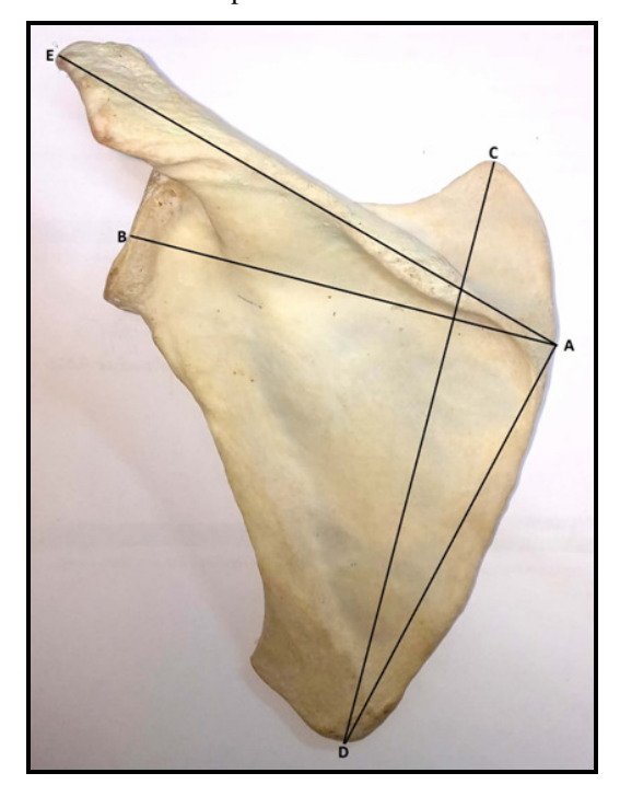
Fig-1: Concepts of different morphometric measurements in scapula

The line C-D represents the scapular length; the line A-B represents the scapular breadth; the line A-D represents the scapular infraspinous length; and the line A-E represents the projection length of scapula.